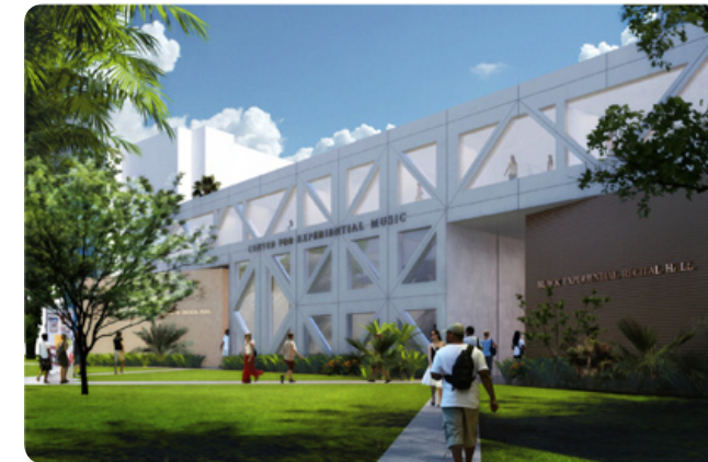
Architect's rendering for a planned new Center for Experiential Music at the Frost School of Music

Entrepreneurship is a hot topic at American music schools, which increasingly aim to ensure that students headed for the stage know exactly what they'll face after graduation. In addition to hours in the practice room, schools are adding courses in finance, web design, public speaking, theater. "Make your own opportunities" is the slogan of the day.