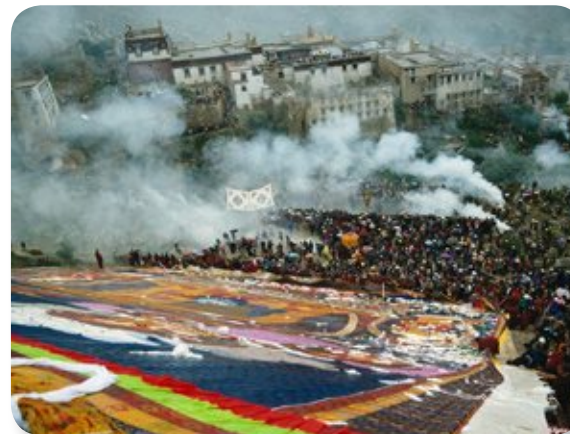
The opening of the Shoton Festival in Tibet.