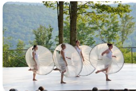
The Belle Contemporary Dance Co. at Jacobs Pillow's Inside/Outside series.