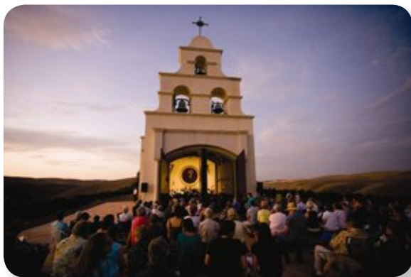
Chapel Hill Shandon, one of Festival Mozaic's historic venues.