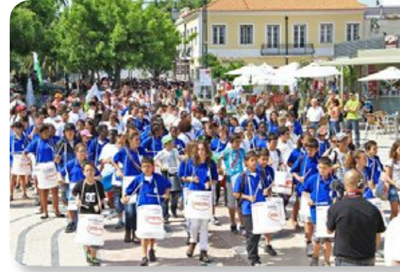
Local school children perform in the Setúbal Music Festival’s annual parade.