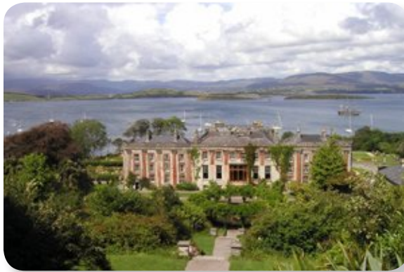
The Bantry House, one of the venues at the West Cork Chamber Music Festival.