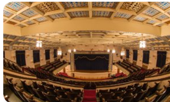
Chisholm High School auditorium at the Northern Lights Music Festival.