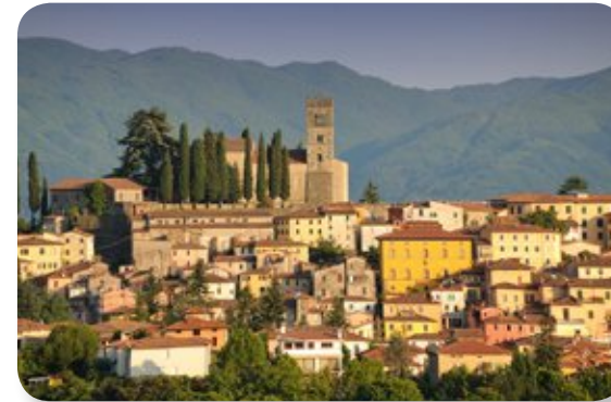
The city of Barga, Italy, site of the annual opera festival.