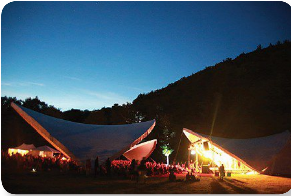
A concert at Phoenicia International Festival of the Voice.