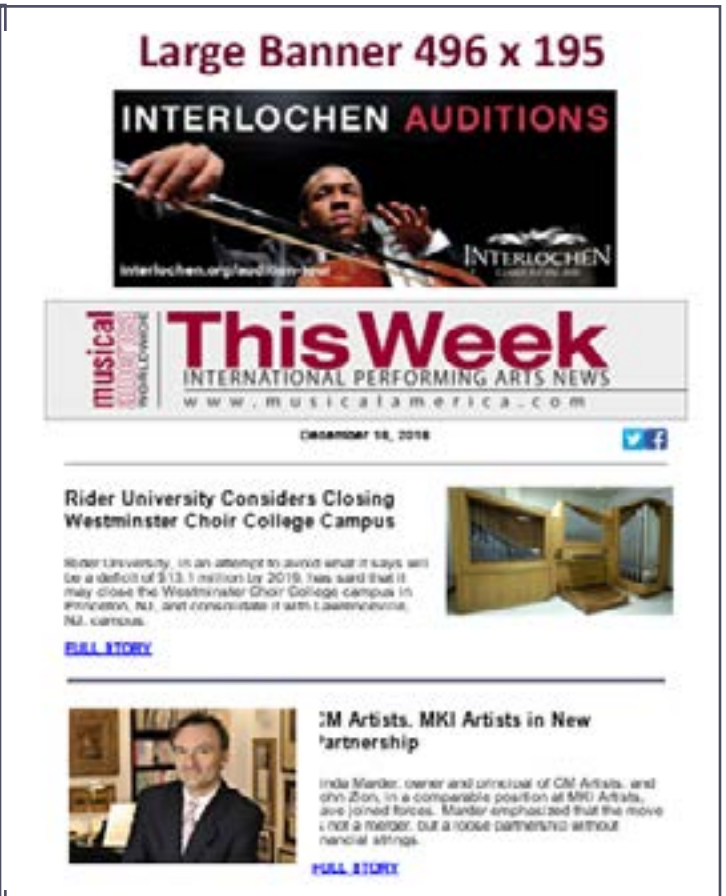
Sample breaking news alert